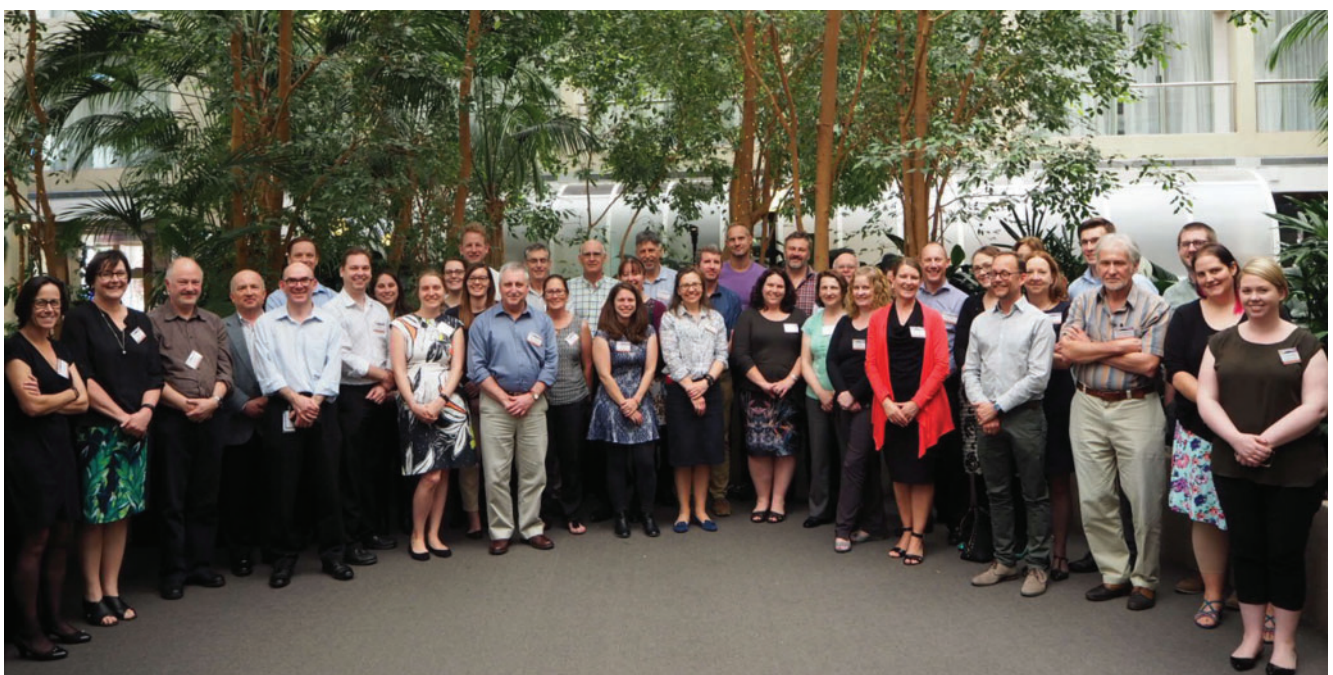
Figure 1. The 50th face-to-face meeting held in Canberra in November 2016 included past and present OzFoodNet members as well as international experts.

CIDT was a major theme discussed at the 50th OzFoodNet face-to-face meeting. There has been a 59% increase in notifications of the three most common bacterial enteric diseases (salmonellosis, campylobacteriosis, and shigellosis) from 2012 to 2016 (Figure 2). The increase in culture independent notifications since the introduction of the multiplex PCR panels in late 2013 has resulted in CIDT-only notifications accounting for 22% of all notifications for these diseases in 2016 (9402/43 646). The majority of these notifications were for campylobacteriosis (29%, 7077/24 166) and shigellosis (28%, 397/1407). The PCR target for Shigella is shared with enteroinvasive Escherichia coli , which is not notifiable, complicating case follow up. However, 11% of salmonellosis notifications were by CIDT only (1928/18 073) representing a loss of typing information used for public health surveillance and outbreak detection. A positive development has been the increasing number of notifications generated by a combination of CIDT and culture methods, usually a result of pathology labs initially screening by CIDT and then retrospectively culturing all positive samples ('reflex testing') for referral to public health laboratories for the purpose of public health surveillance. CIDT and culture testing was performed for 29% of notifications for these diseases in 2016, with